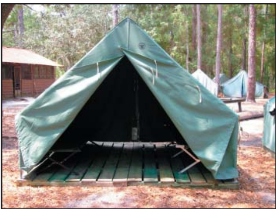
Use a camp tent (above), or bring your own.

The Jack Jennings Trading Post offers hot dogs, pizza, candy, ice cream, soft drinks, craft items, patches, Scout merchandise, t-shirts, and sundries.