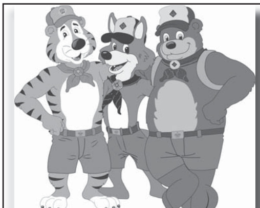
The Three Amigos = Fun with Friends!