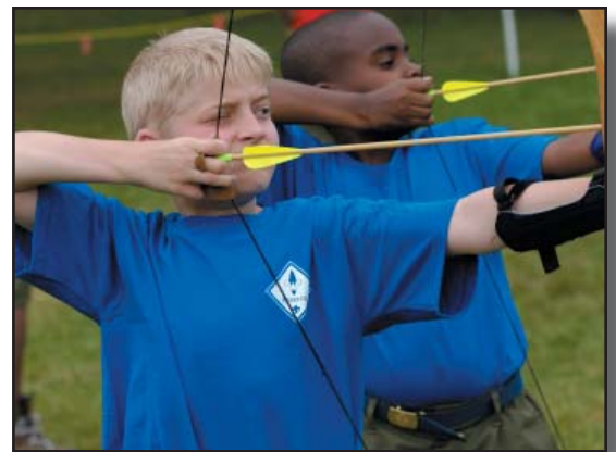
Have Fun at the archery Range!