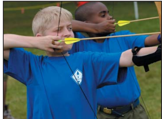
Have FUN at the archery range!