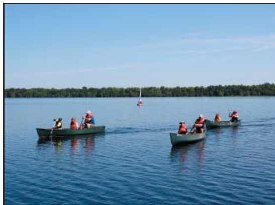
Let's go canoeing!