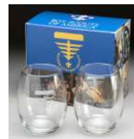
Second Century Society Juice Glass Set